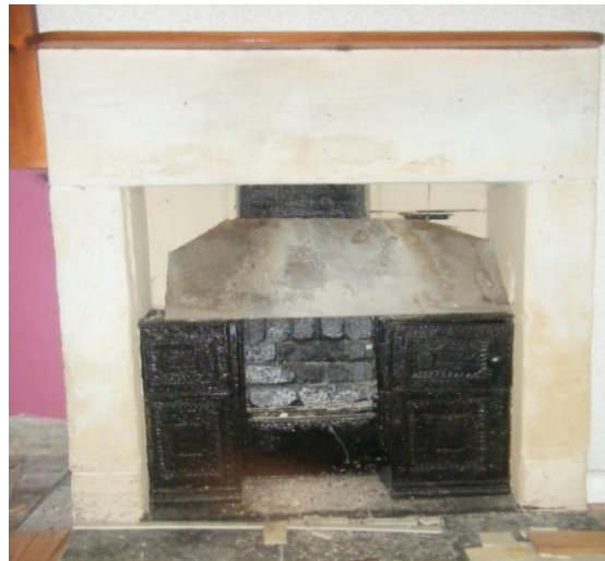
Cast iron hob grate in upper west room in cottage –pre restoration.