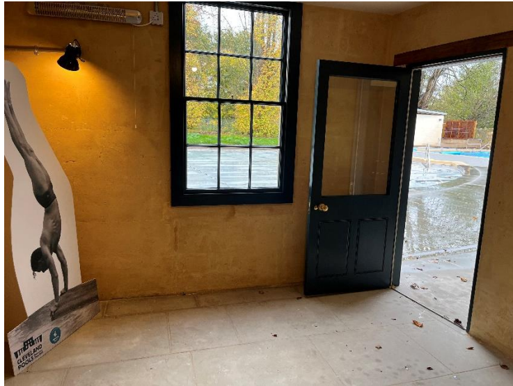
Cottage Interior View Post – Restoration, courtesy of the Cleveland Pools Trust

The rooms in the cottage will be used as offices by Fusion Lifestyle, the Cleveland Pools Trust's operating partner. People will enter the poolside through the ground floor room. Access to the first floor is enabled by an outdoor metal bridge from the entrance path.