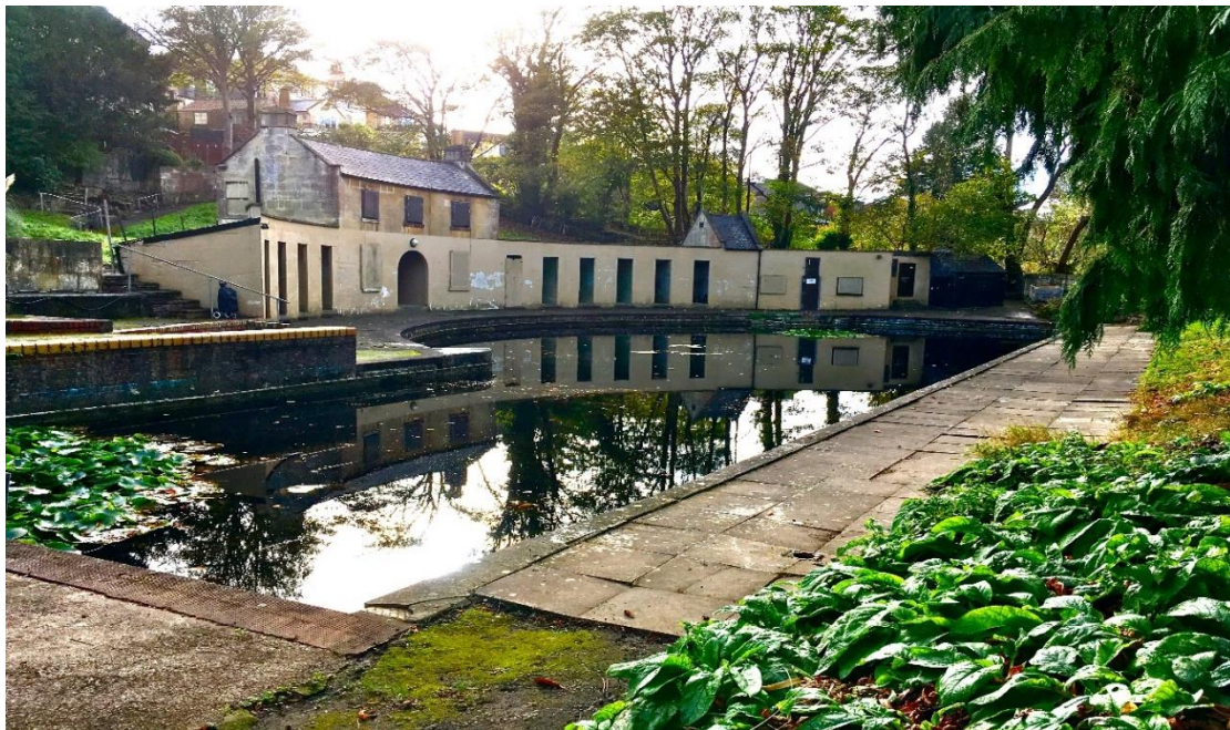
The cottage within the crescent of changing rooms, pre – restoration 2018

The whole structure of the crescent of changing rooms with its central cottage is original, dating from 1815 - 1816; a two-storey cottage is flanked on either side by wings of six changing cubicles. There is a taller block and extension to the west, integral to the original build, which housed the Ladies Pool, Perpetual Shower and two large dressing rooms. It is likely that the whole crescent was designed by John Pinch the Elder, a skilled architect who designed many notable buildings in the wider Bathwick area. Amongst the original fee-paying subscribers to the Pools, Pinch is one of the few whose fee is shown as 'gratis', acknowledging their contribution to the inception of this remarkable Georgian bathing facility.