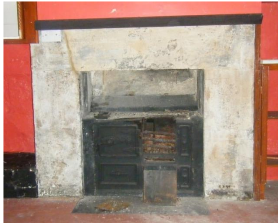
Cast iron range in west ground floor room of cottage pre - restoration

There are four fireplaces inside, with three remaining cast-iron ranges. The ranges provided heating, washing, and cooking and the Cleveland Pools Trust wished to make a feature of them to explain to visitors (especially children) what living conditions were like in the nineteenth and twentieth centuries. One of the ranges is dated 1842 and was produced by the Coalbrookdale company. Another range is likely to be one of the few ranges manufactured by 'Gardiner & Sons Ltd', now Gardiner Haskins of Bristol. A further range is a Falkirk type range, possibly dating from the 1900 – 1920 period, very common in working buildings and poorer households.