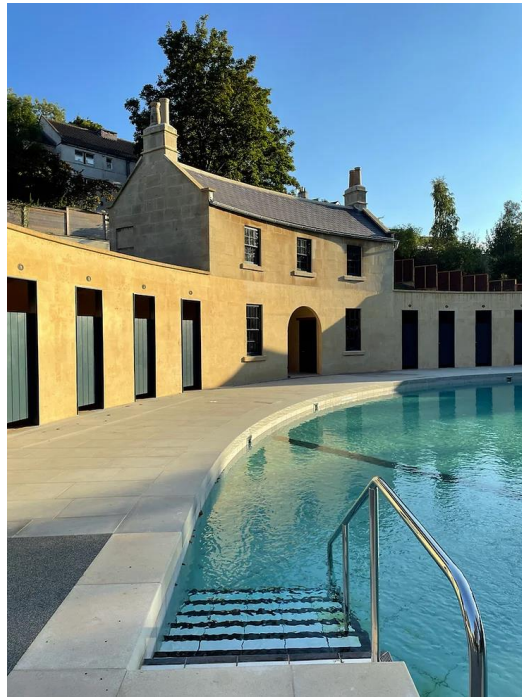
View of the restored cottage in 2022

Cleveland Pools is listed Grade II* and is significant as the oldest surviving public outdoor pool in the UK. Its location within the City of Bath World Heritage site, and crescent form referencing the well-known crescents of Georgian Bath, add considerably to its heritage value. This unique property was on Historic England's 'Heritage at Risk' register and, having been out of use for over 30 years, in very poor condition. The main aims and objectives of the restoration project were to restore swimming to the site, conserve and update the existing building and provide new facilities to complement and support this purpose.