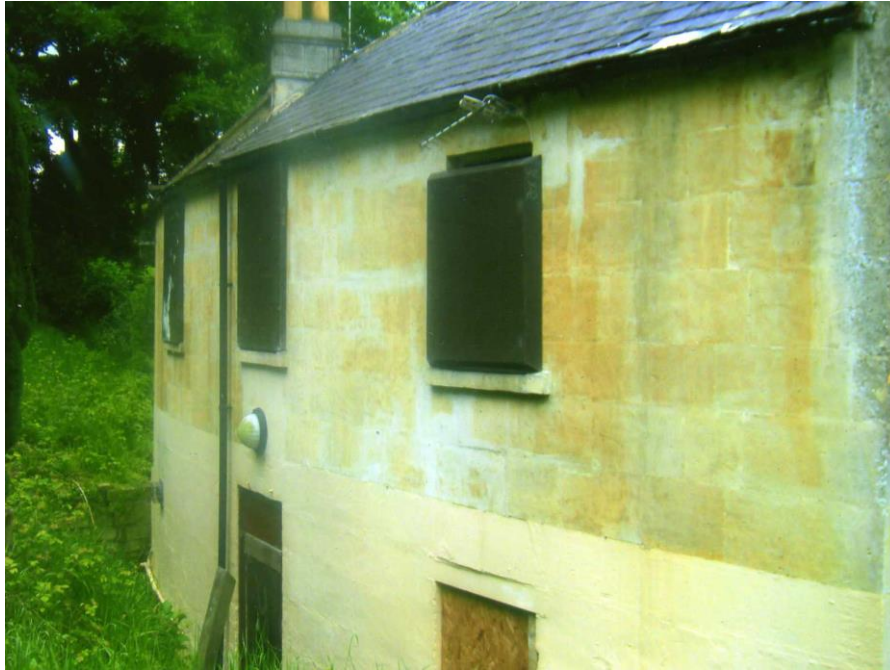
South Elevation of Cottage – Pre-Restoration Photograph courtesy of Ainslie Ensom MSc.HistBdgCons

The south elevation of the cottage has a central door accessed by steps which may be original, a window to its east and three above.